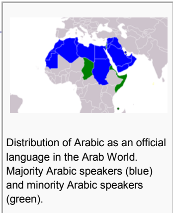
Distribution of Arabic as an official language in the Arab World. Majority Arabic speakers (blue) and minority Arabic speakers (green).

Arabic has lent many words to other languages of the Islamic world , like Malay , Turkish , Urdu , Hausa , Hindi and Persian . During the Middle Ages , Literary Arabic was a major vehicle of culture in Europe, especially in science, mathematics and philosophy. As a result, many Euro-